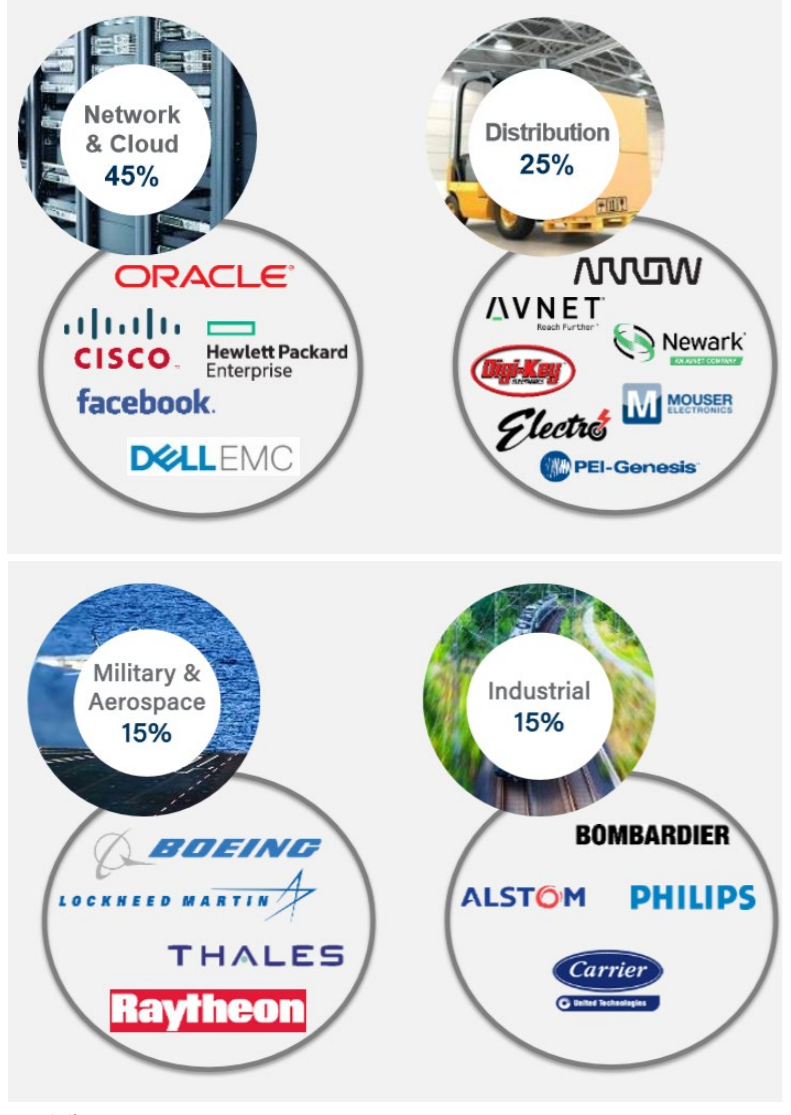
Figure 14 - Bel Fuse Inc. - Customer Map