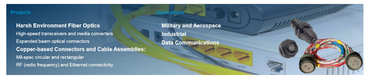
Figure 7 – Bel Fuse Inc. – Connectivity Product Applications and Sample Connector

Bel offers a comprehensive line of high speed and harsh environment copper and optical fiber connectors and integrated assemblies, which provide connectivity for a wide range of applications across multiple industries including commercial aerospace, military communications, network infrastructure, structured building cabling and several industrial applications. Typical applications shown in Figure 7 and Product Map in Figure 8.